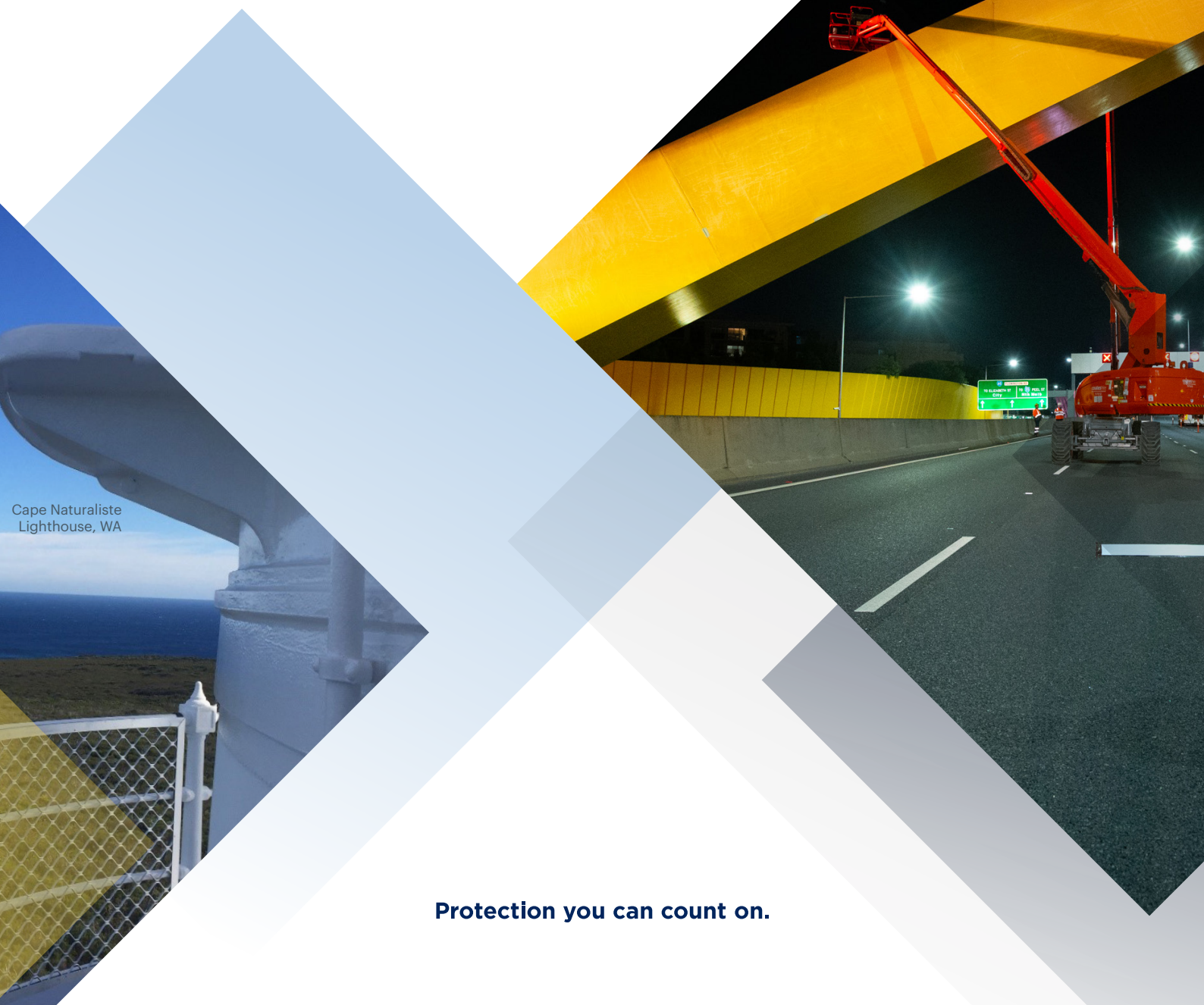
Cape Naturaliste Lighthouse, WA