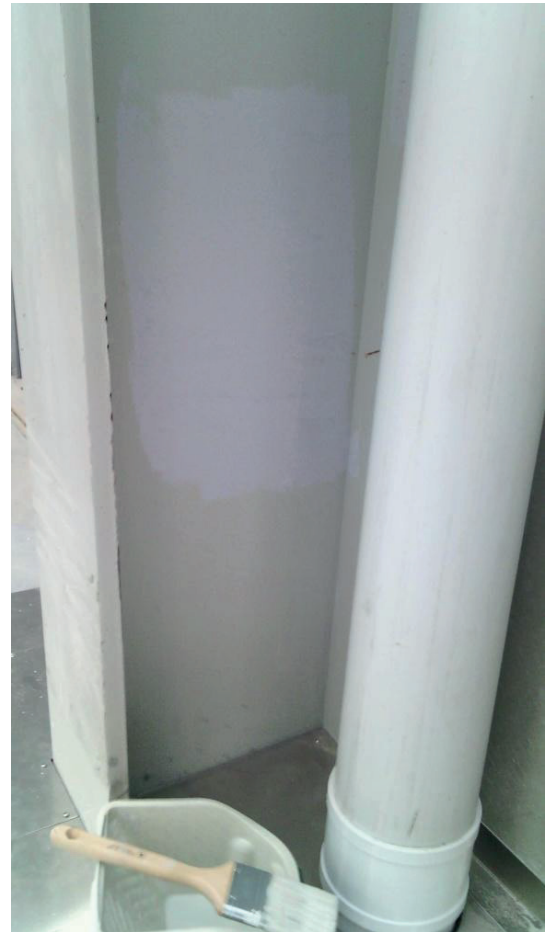
Freshly mixed zinc phosphate epoxy primer was applied over the same product applied only a couple of weeks earlier. Yellowing is clearly visible. As mentioned in the product's data sheet, this yellowing is expected, but will not detract from the protective properties of the product.

If colour is important, then polyurethane topcoats are essential to provide long term colour and aesthetics.