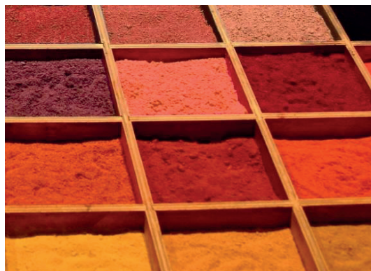
Colour is delivered by either grinding the coloured pigment into the base paint at manufacturing stage or by adding tinter to the product at point of sale.

Close colour matches using different types of products and different tinter systems are heavily dependent on the skill of the colour matcher and the specific light source used, however there are certain colours (such as extra clean, bright colours in the Pantone Matching system) that are simply not achievable using paint and tinter.